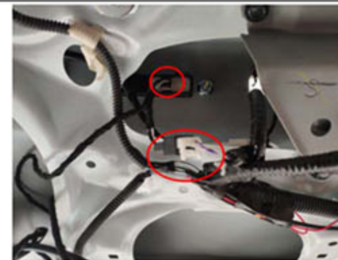
11. Remove the latch plug of the original vehicle and connect it with the harness of our company