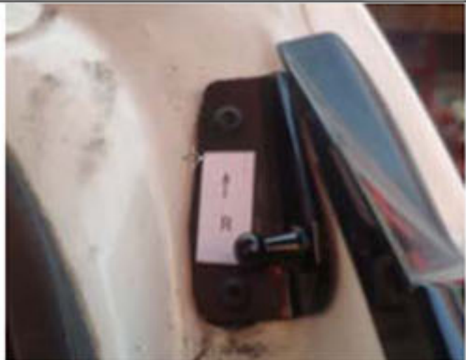
5. Install the body bracket of our company