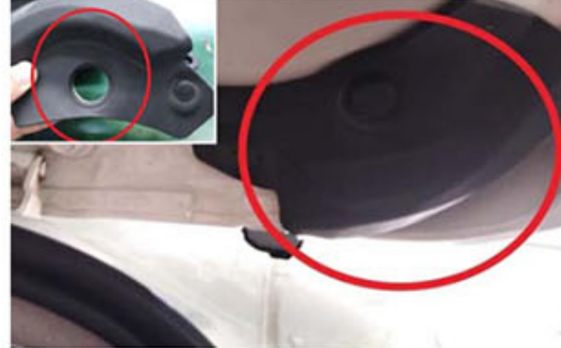
7. Cut the original turning hole with an artist's knife (the left and right are the same)