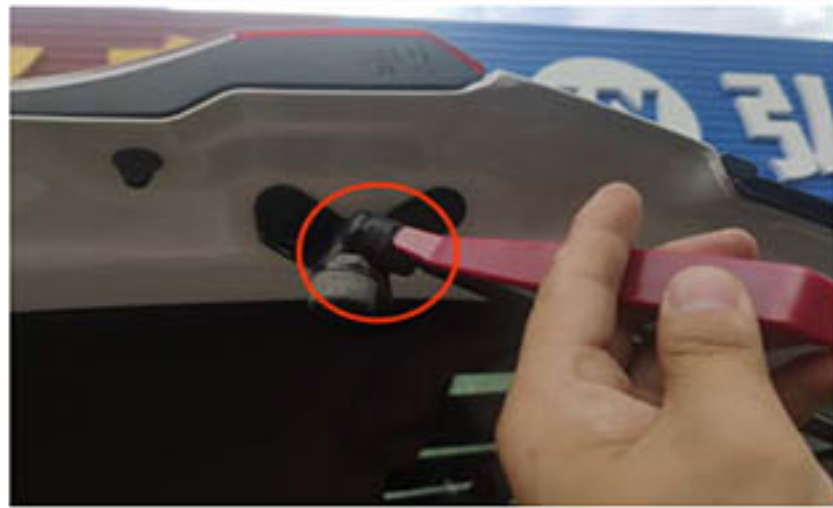
3. Pry off the gas spring snap ring with a tool, and remove the gas strut of the original vehicle (the left and right are the same)