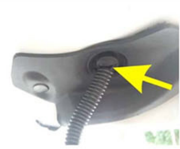
8. Thread the stay wire into the reserved hole and plug the rubber plug