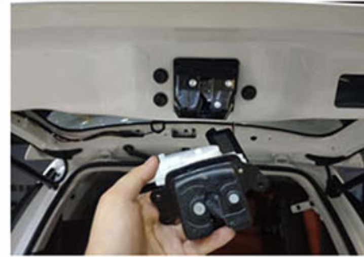
9. Remove the original vehicle lock machine and install our electric lock machine