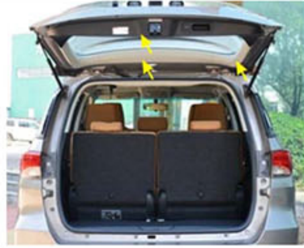
2. Remove the middle trim panel in the figure below