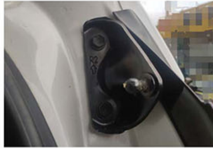
4. Remove the original vehicle body bracket (the left and right are the same)