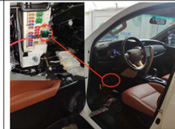
12. Find the fuse box under the driver's seat