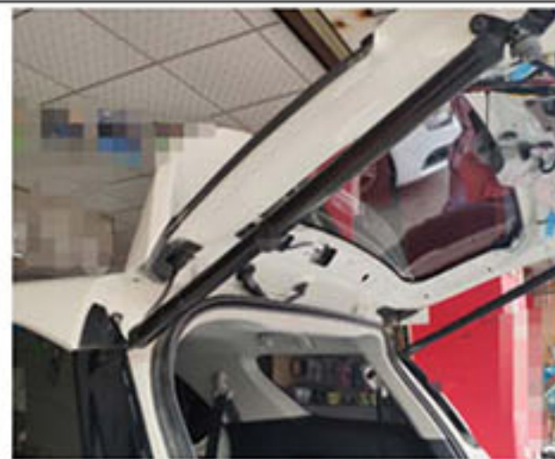
6. Install our electric brace