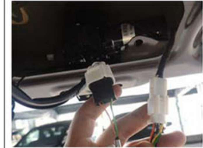
10. Pull out the original vehicle lock plug and connect it with the electric suction plug of our company